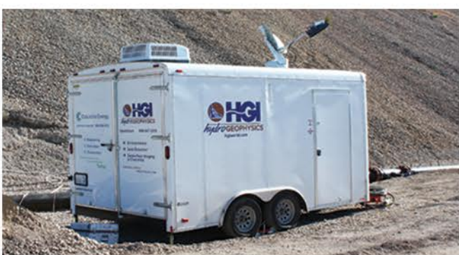
HGI's Geotection Resistivity Monitoring System deployed at a dam site

HYDROGEOPHYSICS, INC. (HGI) HAS PIONEERED SUBSURFACE GEOPHYSICAL MONITORING TECHNIQUES FOR DEPLOYMENT ON DAMS AND EARTHEN STRUCTURES, INCLUDING LEVEES, EMBANKMENTS, AND TAILINGS STORAGE FACILITIES. IN OUR APPROACH, WE APPLY COST-EFFECTIVE, HIGH-VALUE INFORMATION OVER LARGE REGIONS AND IN A NON-DESTRUCTIVE MANNER, VERSUS DRILLING, CPT, AND OTHER MORE INVASIVE SAMPLING METHODS.