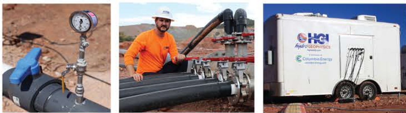
HGI professionals have the skills and experience to support every aspect of your project from concept and design to acquisition and interpretation.

With the system's flexibility and capacity to sample and store data so quickly, Geotection can act as both a long-term monitoring and short-term rapid acquisition system that is capable of high temporal and spatial resolution. Geotection can collect, store, and provide information in near real-time on subsurface solution migration. This versatile mobile acquisition system can be operated remotely via satellite and has a multi-level alarm system to alert operators of power disruptions, equipment problems, and extreme climate changes through SMS messaging and email alerts. Additionally, Geotection can be powered from a generator or direct AC and the internal climate controlled trailer has enough room to work, eat, and sleep.